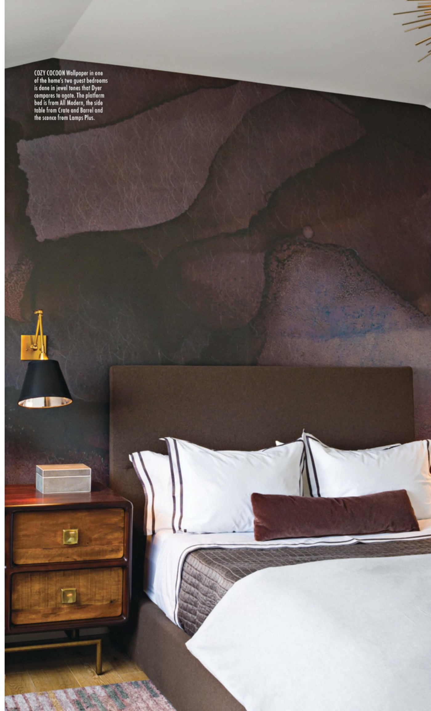
COZY COCOON Wallpaper in one of the home’s two guest bedrooms is done in jewel tones that Dyer compares to agate. The platform bed is from All Modern, the side table from Crate and Barrel and the sconce from Lamps Plus.